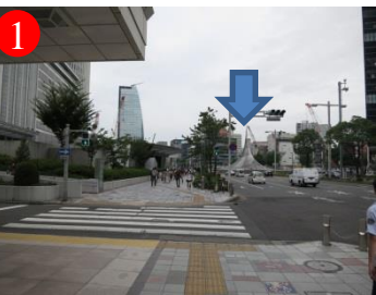
You can see the monument on your left hand side.