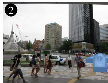
Pass the cross walk.