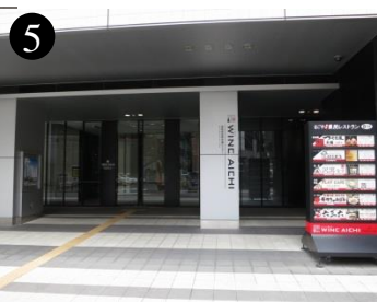
The entrance of WINC Aichi.