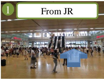
Go through the Sakura-Dori Side exit and turn right .