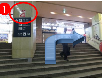
Up the Exit 4 and turn right.