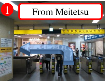
Go through the central gate and turn left.